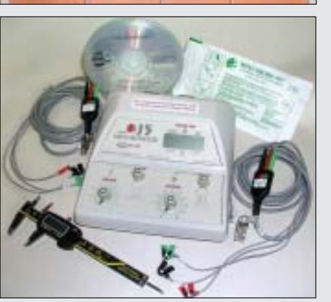
J5 Myo-monitor – With accessories and Clinical Technique CD.